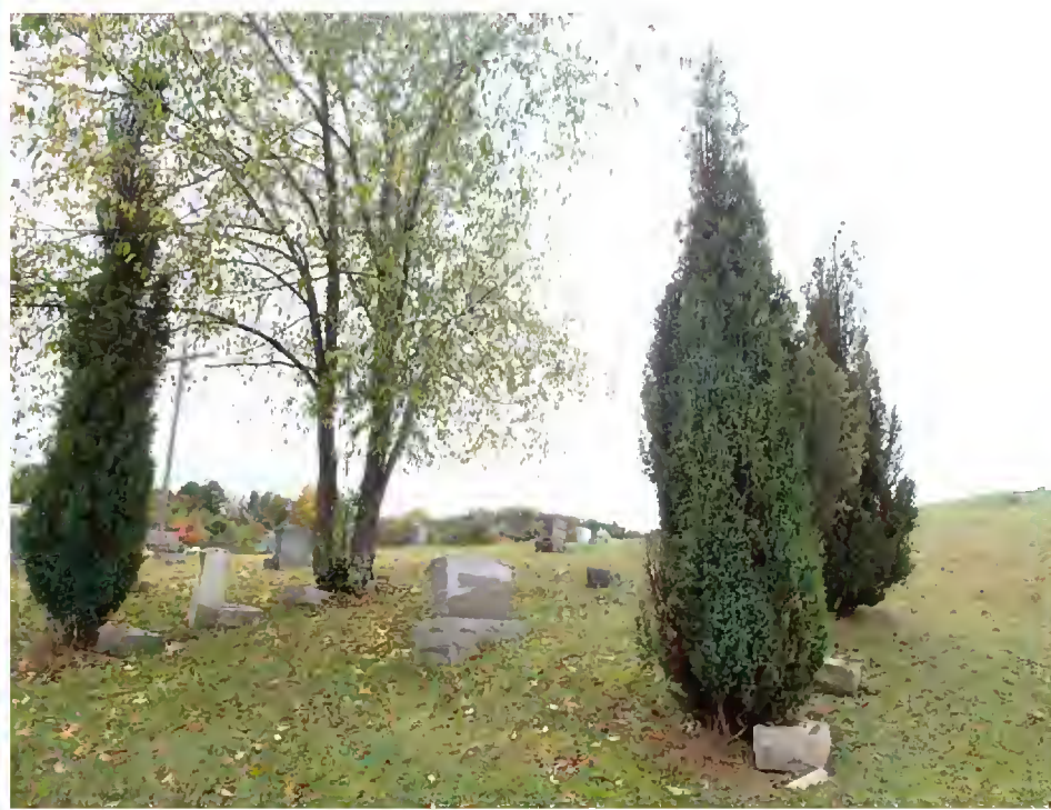
Fig. 11. Elkins, WV cemetery with cultivated J. c. var. communis trees.